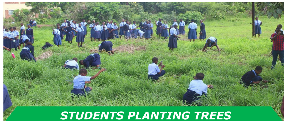
STUDENTS PLANTING TREES

"Climate change is not just an environmental issue; it's a community challenge and a national crisis, reshaping livelihoods, economies, and the future of generations to come."