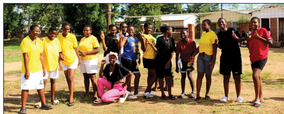
St. John Girls' Secondary School team

enthusiasm. The cheers from the sidelines by our students and staff further energized the game, making it a memorable event for all who attended.