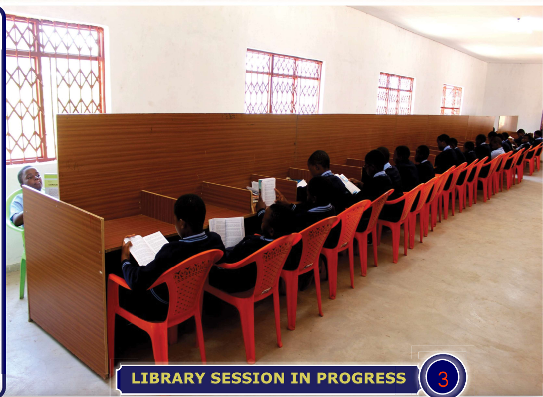
3 LIBRARY SESSION IN PROGRESS