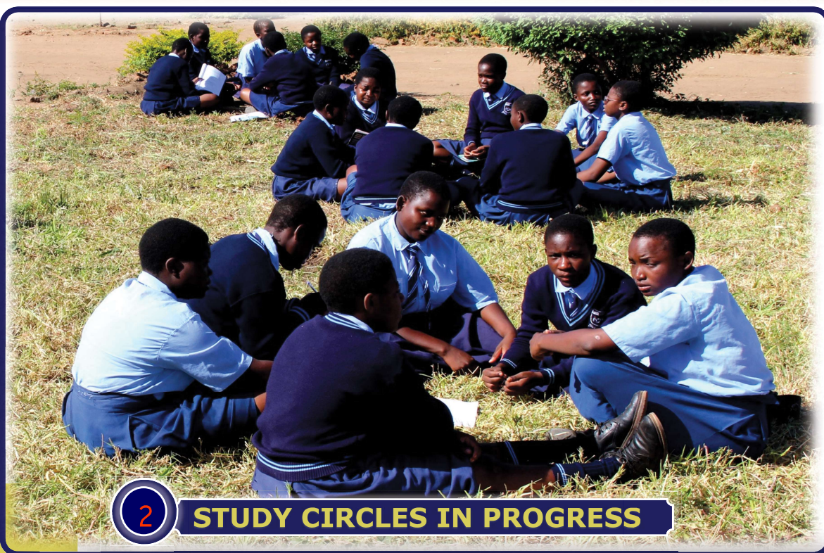
2 STUDY CIRCLES IN PROGRESS