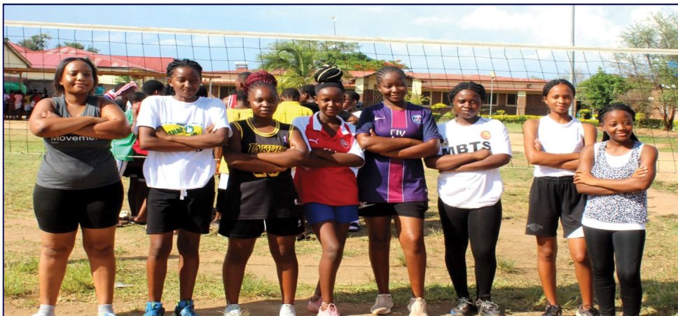
DIM-St. John the Baptist University team

O n Saturday, December 7, 2024, St. John Girls' Secondary School hosted a thrilling volleyball friendly match against a visiting team from DMI-St. John the Baptist University. The event took place on our vibrant school sports grounds, offering a fantastic opportunity for camaraderie and healthy competition between the two institutions.