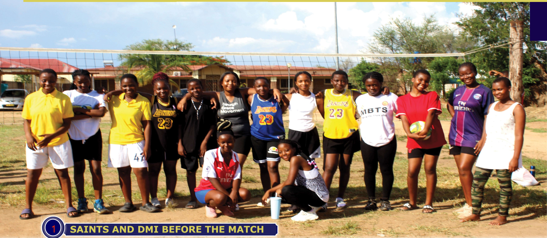
1 SAINTS AND DMI BEFORE THE MATCH